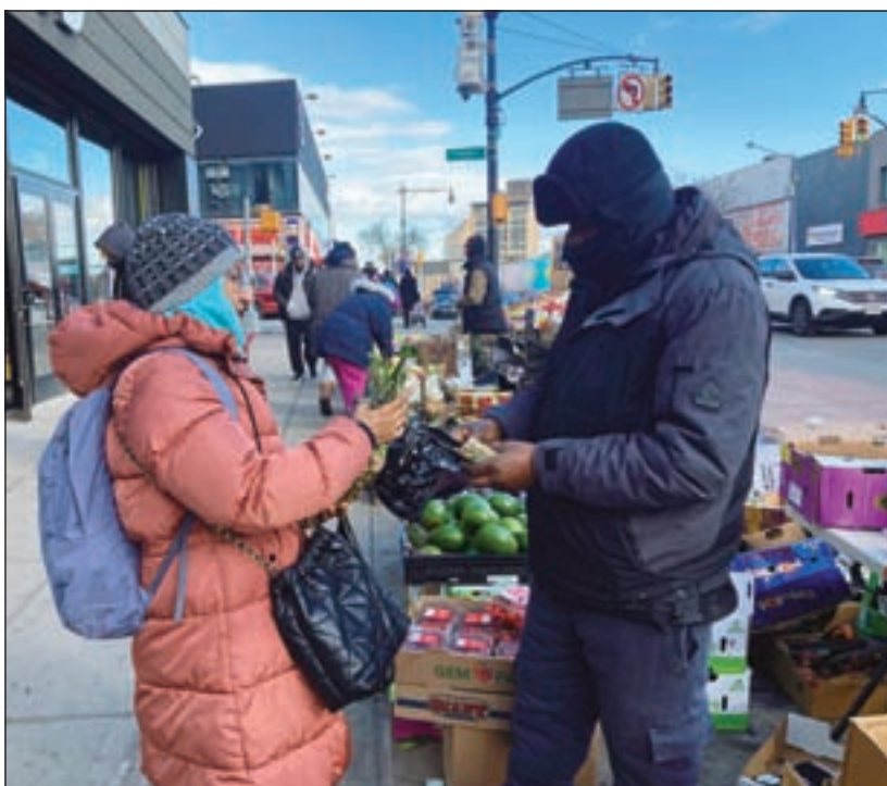
A STREET VENDOR sells produce to a customer on East Fordham Road in the Fordham Manor section of The Bronx on Feb. 11, 2026.