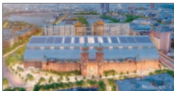
AN EXTRACT FROM a presentation on the latest project for the Kingsbridge Armory, "The Kingsbridge Center" by NYC Economic Development Corporation (EDC).

He talked about preserving the borough's basketball legacy, teaching youth, and encouraging their dreams and desires to succeed. He said similarly De-