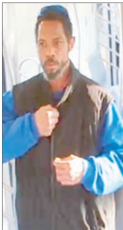
Olinville: Arrest Made in Unprovoked Stabbing

The NYPD said a 50-year-old man has been arrested following an unprovoked stabbing assault in Olinville on Friday, April 18. Earlier the same day, police had asked for the public's help identifying the man seen in the accompanying photo above who they said was sought in connection with the incident. They said that on Friday at around 7 a.m., a 21-year-old male victim was aboard a southbound 5 train in the vicinity of White Plains Road and the East 219th Street subway station when he was approached by a suspect.