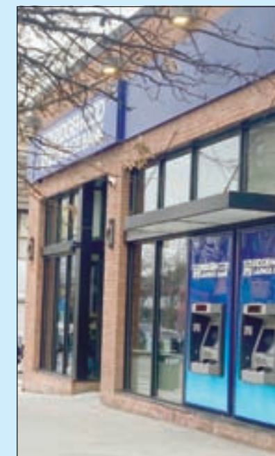
RIDGEWOOD SAVINGS BANK , Norwood, March 15, 2025

Additionally, in 2024, officials said Ridgewood was honored to collaborate with neighbors and support many meaningful causes throughout the year. This included $1,011,916 in corporate giving, donations & outreach, $175,950 in community reinvestment, $86,123 in employee charitable giving, $83,858 in bank-matched donations, and 1,581 employee volunteer hours.