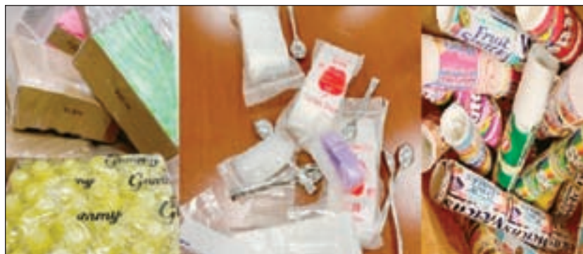
DRUGS, DRUG PARAPHERNALIA and cash were removed from 3267 Decatur Avenue in the Norwood section of The Bronx in November 2024 following a dawn raid of the home by federal agents