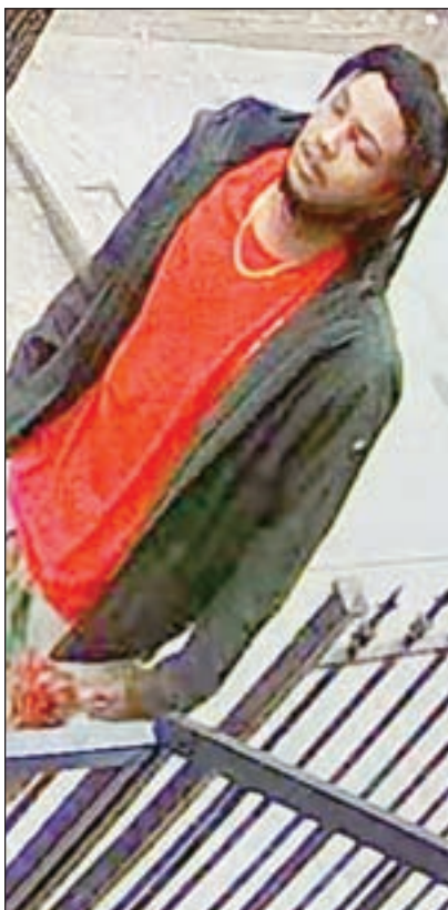
Fordham Manor: Man Sought for Non-Fatal Shooting

The NYPD is asking for the public's help identifying and locating the person seen in the accompanying photo above who they say is wanted in connection with a reckless endangerment incident (shooting) that occurred in Fordham Manor. Police said that on Tuesday, April 22, at around 5.35 p.m. in front of 2584 Briggs Avenue, an unidentified individual displayed and discharged a gun.