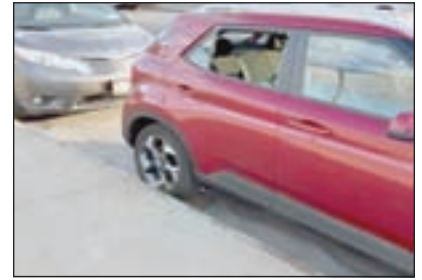
A CAR IS seen parked at 7 Bedford Park Boulevard in the Bedford Park section of The Bronx with a broken window in an undated photo posted to the Citizens' App in April 2025.

See the latest auto theft stats for the local area in our Crime File section.