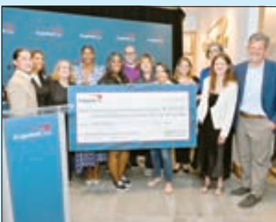
LOCAL ELECTED OFFICIALS, representatives of Fordham Road BID and the BXEDC joined Capital One officials and others for the grand opening of Capital One's branch at 151 East Fordham Road on Saturday, April 26, 2025.

They said funds will provide direct support to start-up incubators, bolster the local business improvement district, expand small business loan programs, and offer technical assistance and financial counseling to entrepreneurs and residents. Visit https://www.capitalone.com/about/newsroom/capital-one-announces-usd1-million-investment-for-the-bronx/ for more information.