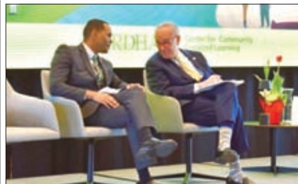
REP. RITCHIE TORRES (NY-15) and U.S. Senate Majority Leader Chuck Schumer (D-NY) attend a climate summit at Fordham University on April 8, 2024.

High rates of asthma among Bronx youth exacerbated by fumes emanating from the vehicle-heavy Cross Bronx Expressway which crosses the district, have long been a cause for concern. According to a September 2021 report by the City's health department on asthma-