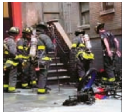
MEMBERS OF LADDER 33 / Engine 75 extinguish an e-bike / scooter fire outside a 5-story building at 2105 Ryer Avenue in Fordham Heights on Sunday, May 12, 2024.

Torres is currently leading the "Safer Heat Act of 2023" to