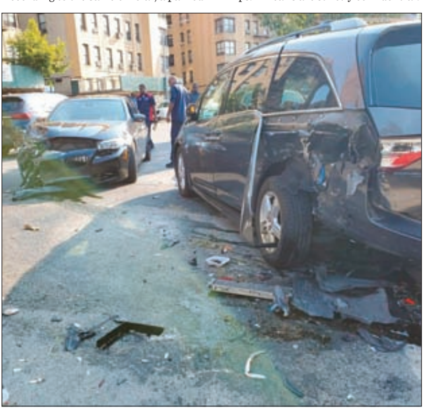
POLICE ARE LOOKING for the driver of a stolen 2005 BMW who plowed into two PARKED CARS ON Jerome Avenue in the Bedford Park section of The Bronx on Friday, Sept. 9, 2022.

Anyone with information regarding this incident is asked to call the NYPD's Crime Stoppers Hotline at 1-800-577-TIPS (8477) or, for Spanish, 1-888-57-PISTA (74782). The public can also submit their tips by logging onto the CrimeStoppers website at <u>https://crimestoppers.</u> <u>nypdonline.org/</u>, or on Twitter @NYP-DTips. All calls are strictly confidential.