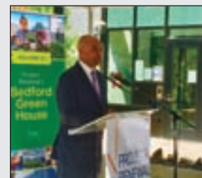
Bedford Green House Grand Opening pg 5