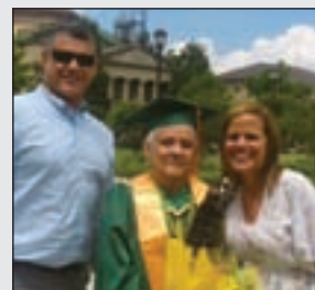
1961 Freshman Graduates from BCC pg 7