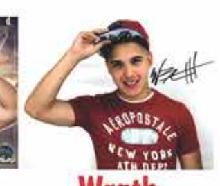
Anayka Bharati Dance Academy EC Salsero