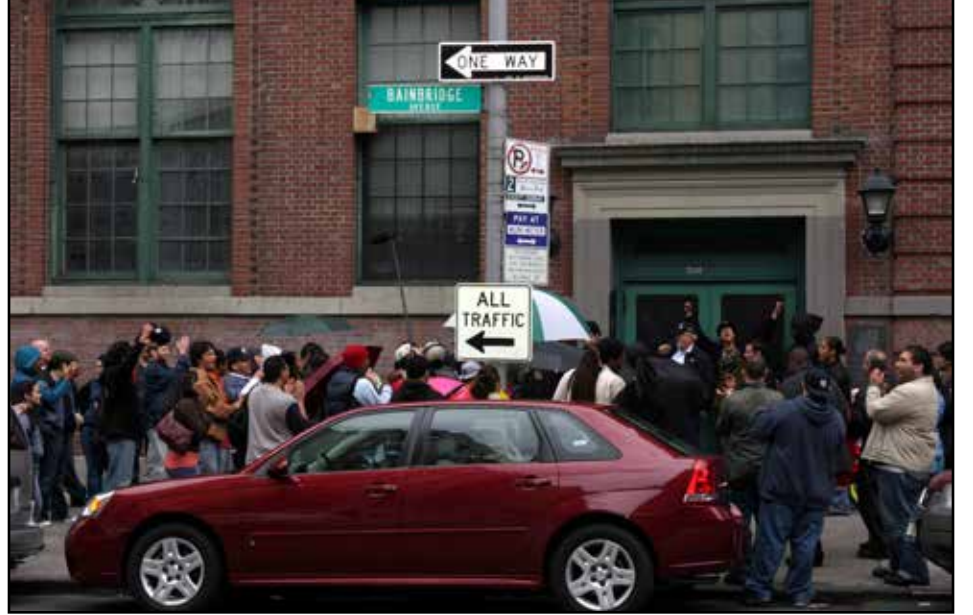
IN 2007, there were several rallies by community groups asking the city to turn the old Fordham Library into a community center.

For more Neighborhood Notes online, go to www.norwoodnews. org and click on "Neighborhood Notes."