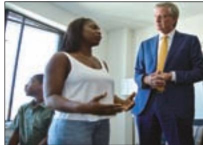
MAYOR BILL DE BLASIO

The mayor also announced the creation of a Tenant Anti-Harassment Protection Unit within the Department of Housing Preservation and Development (HPD) office. The unit is a response to the increased amount of harassment complaints against developers. "Most landlords follow the law but there's an unscrupulous few who do a huge amount of damage," the mayor said