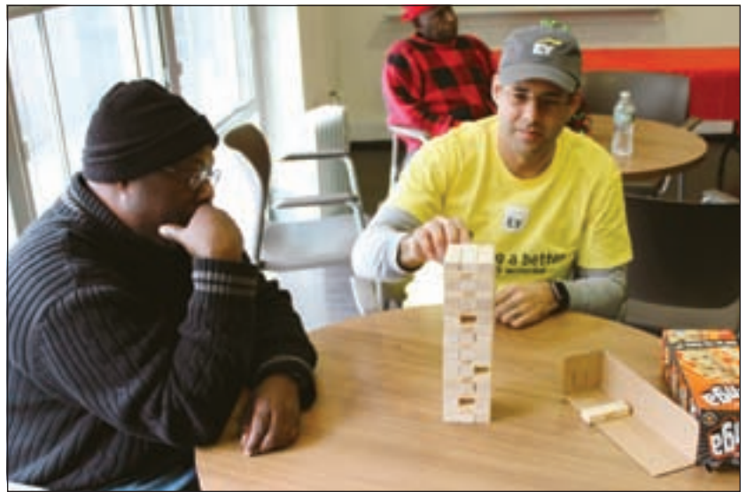
A JERICHO TENANT (left) and volunteer play a game of Jenga at the holiday party at Kingsbridge Terrace.

The U.S. Department of Veterans Affairs released data that shows that most veterans across the coun-