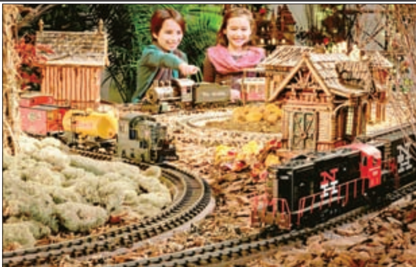
CHOO-CHOO! The New York Botanical Garden Annual Holiday Train Show is already under way and spreading some cheer (more information can be found under Events).

THE BRONX LIBRARY CENTER is in the holiday spirit. Check out some holiday-inspired offerings in our Editor's Pick in Library Events sections.